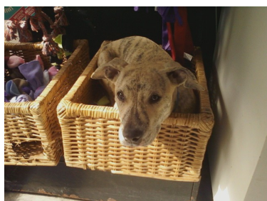
Tama's dog Liara making herself a comfortable bed in amongst the Tug Toys.

"Our experienced trainers compete at a national level, and teach using positive reinforcement methods which have been proven to be the most effective way of teaching"